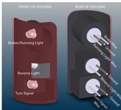
TYPE A - MOST Trucks

These Taillight housings look identical from the outside, but they operate very differently. If you look at rear, you'll see why: one uses bulbs with multiple filaments, the other uses a single filament bulb to do multiple functions. Both have a separate reverse light bulb. That is generally universal. But look at the Turn/Running Lights/Brake signals: